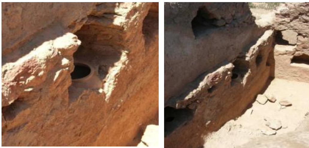
Castle mountain of Qayen

This castle of the places which are scattered among these mountains and mountain region that has overcome the plain, a narrative history, is made by Sam Ibn Nariman .7