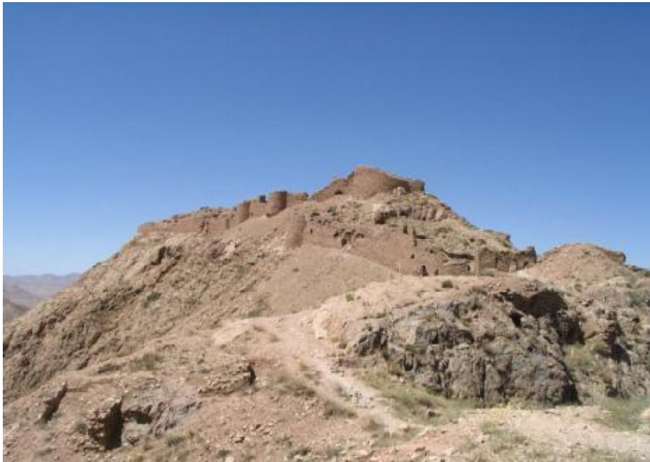
Castle mountain of Qayen

Castle Mountain Qayen can be the most important cultural centers and even the civilization of East considered significant enough role in the development of science and religion had the land. Role in the papers on Color this castle, this castle valuable indicator position in the past and the forgotten role in the present. If this work be properly introduced to visitors, especially with the exposure of the main highway south of Khorasan, for many interesting and even tourists will be controversial memory. Failed at the heart of the region castles share appropriate for attracting tourism to the area in and where we value the natural and historic , innocence washed the dust and world see the it .