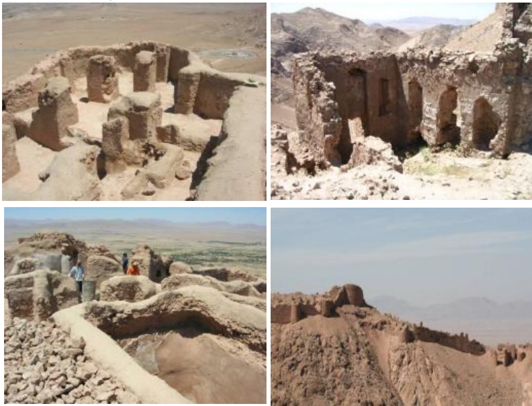
Castle mountain of Qayen

Castle mentioned longitudinal extent of more than five hundred meters in width and much less, is built on the heights, (plan comes into the castle). This area to the smaller area of several different applications have apparently has been divided. The military is uses such as settlement and warfare, residential and comfort from Castle Place, culture or location, and teaching and library, and the animals of the location such as horse riding and wagon and mule There is a floor and two floor buildings as well as visible currently available. There are several rooms with different dimensions of wood cover is fully confirmed.